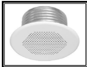
New - Perforated Cover Plate